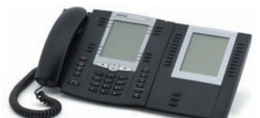
Aastra 6757i with its M675i module